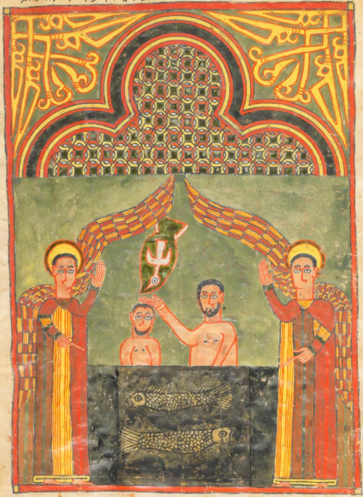
The Baptism of Christ