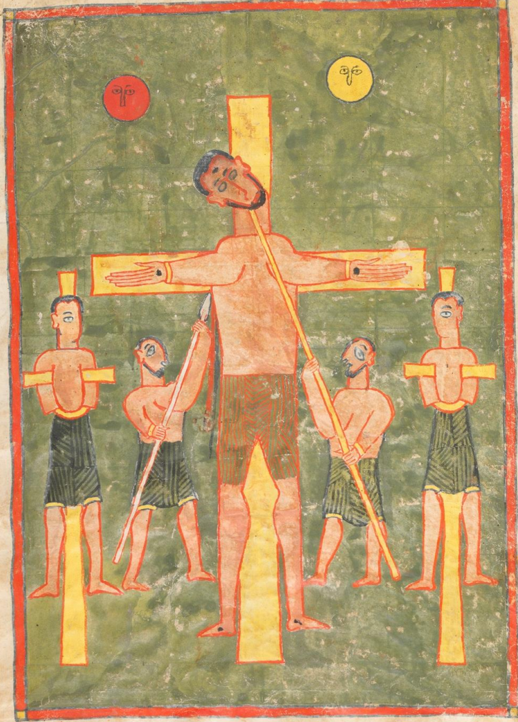
The Crucifixion of Christ

ኃበ፡ሰቅልዎ፡ለጎግዚ፡ጎኔ፡ ጌጎተዊ፡ዘጸጋጎ፡ ጌጎተዊ፡ዘጠገኦ፡ጌጎተዊ፡ዘጳከተዎ፡