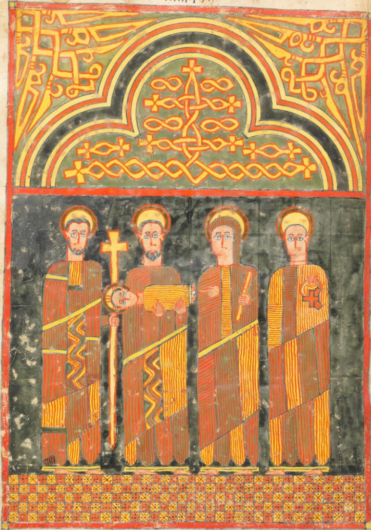
The Presentation of Christ in the Temple

ἡ παρουσία τοῦ κυρίου ἡμῶν ἰησοῦ χριστοῦ ἐν τῷ ἱερῷ