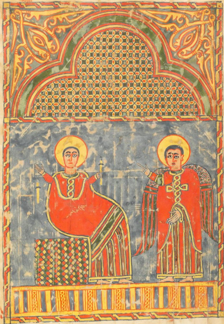
The Annunciation to Mary

ጸጌዛ፡ ቅዱስ ልግ፡ ወርቀ፡ ወጫ ልቅ፡ ለ፡ ተረጎሞ፡ ገብሮ ኤል፡ ገብቶ፡