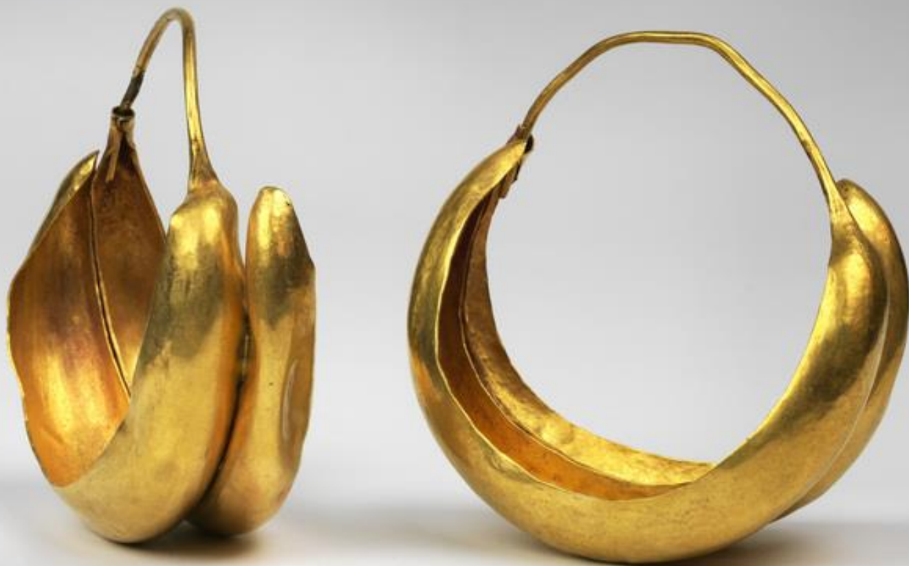
Earrings, c. 2600-245 BC, gold, Penn Museum, Philadelphia, USA

https://www.penn.museum/collections/highlights/neareast/puabi.php