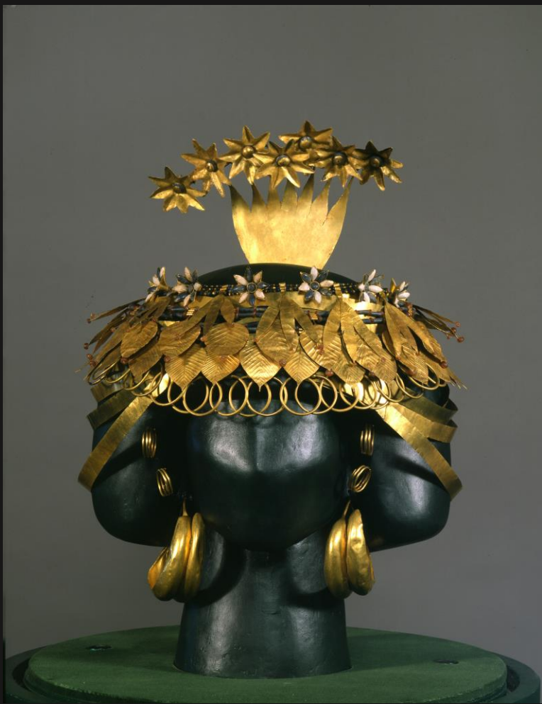
Hair Comb, c. 2600-245 BC, gold, lapis-lazuli, carnelian, Penn Museum, Philadelphia, USA

https://www.penn.museum/collections/highlights/ncareast/puabi.php