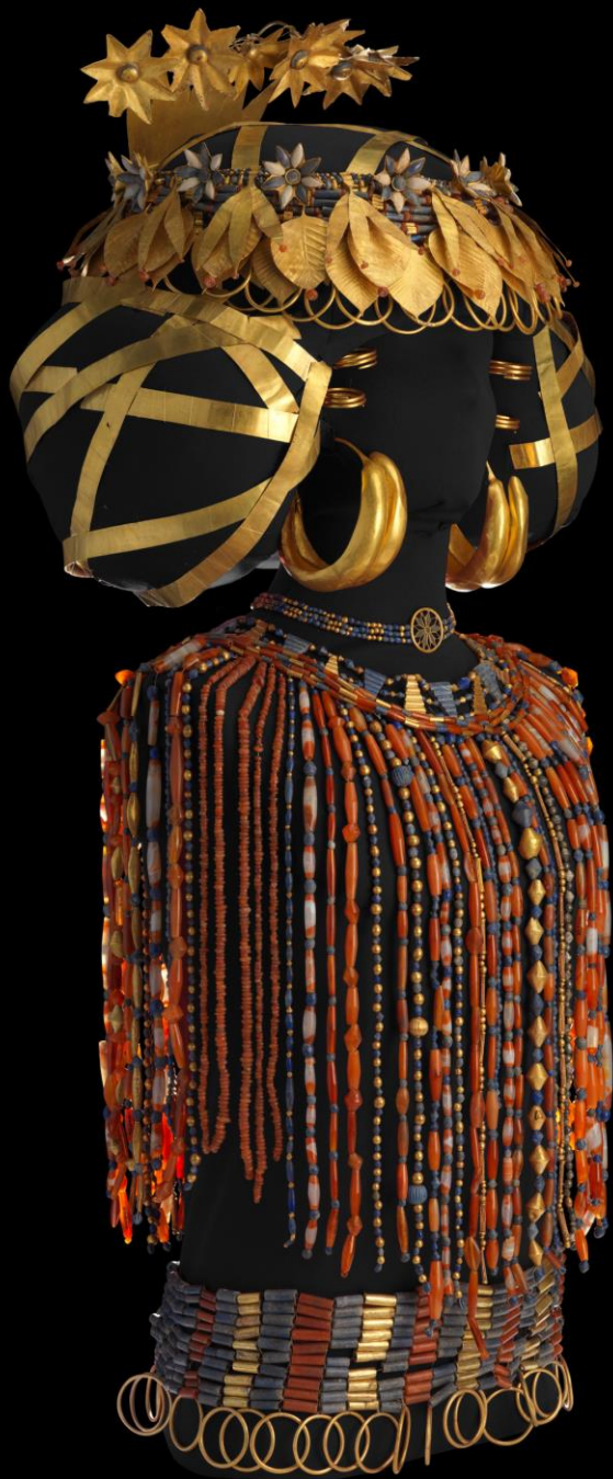
Puabi's Formal Attire, c. 2600-245 BC, Penn Museum, Philadelphia, USA

https://www.penn.museum/collections/highlights/neareast/puabi.php