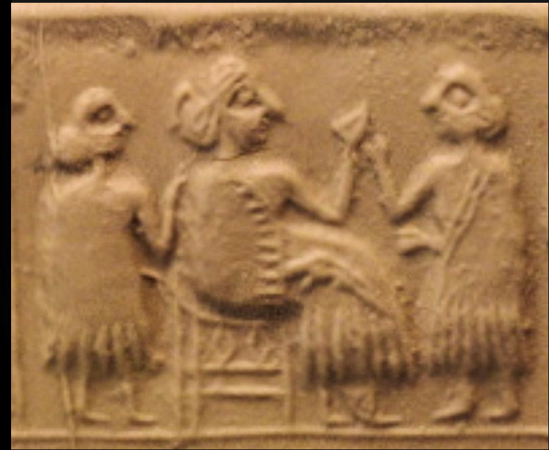
Cylinder Seal, c. 2600- 245 BC, lapis-lazuli, British Museum, London, UK

https://www.britishmuseum.org/collection/object/W_1928-1010-235