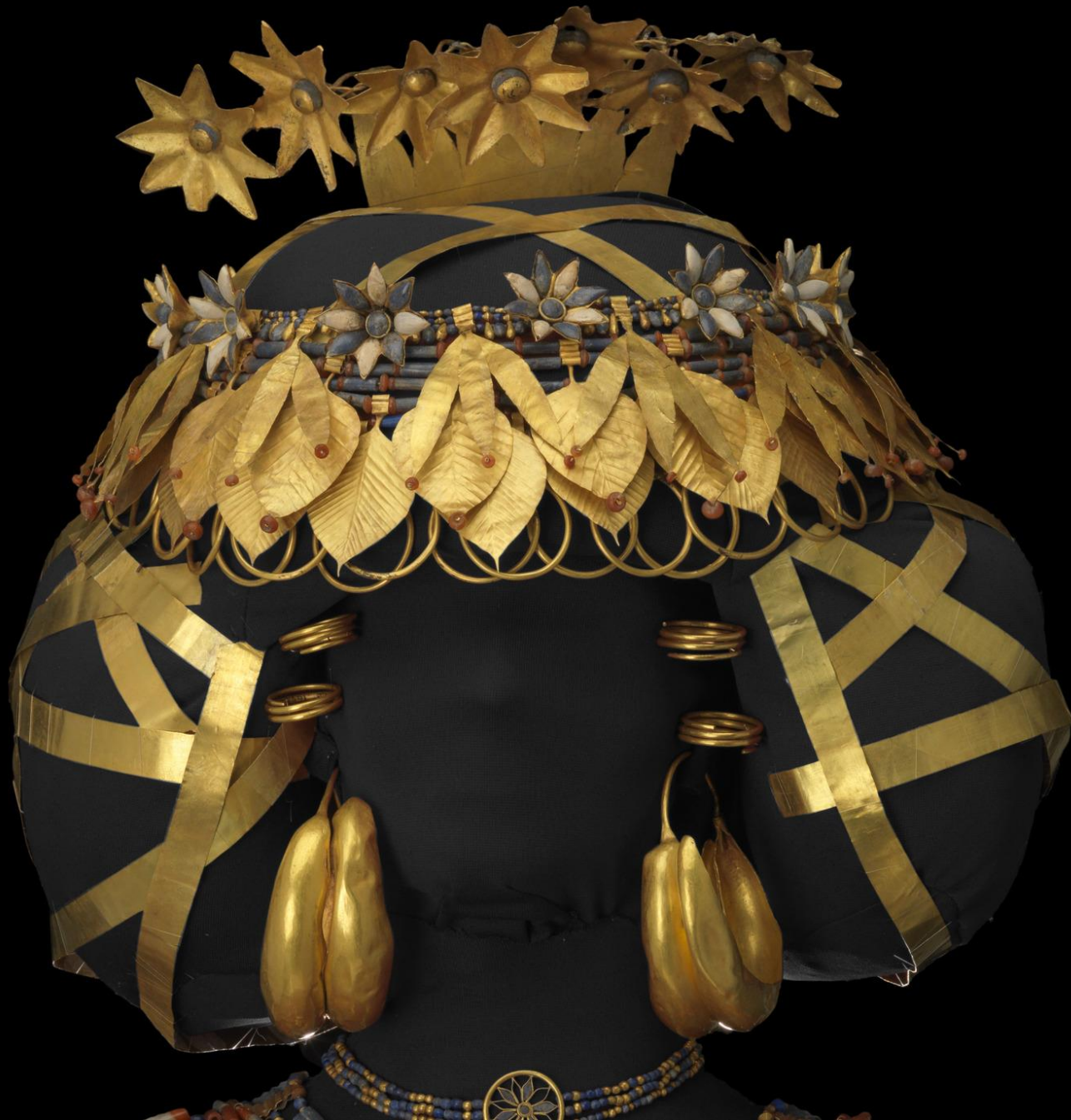
Head Ornaments, c. 2600-245 BC, gold, Penn Museum, Philadelphia, USA

https://www.penn.museum/collections/highlights/neareast/puabi.php