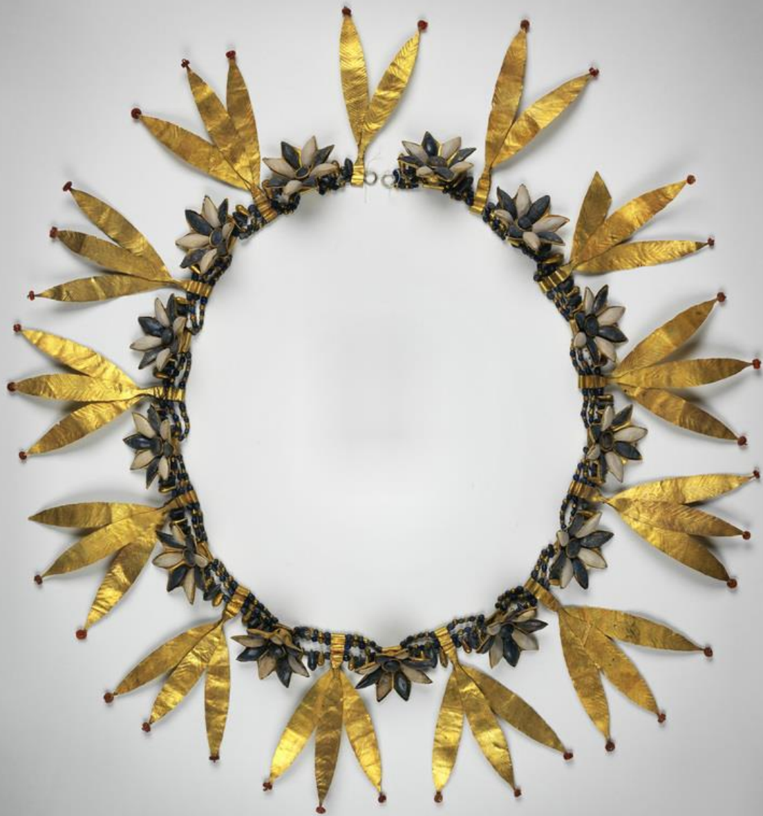
Wreath, c. 2600-245 BC, gold, lapis-lazuli, shell, carnelian, Penn Museum, Philadelphia, USA

https://www.penn.museum/collections/highlights/neareast/puabi.php