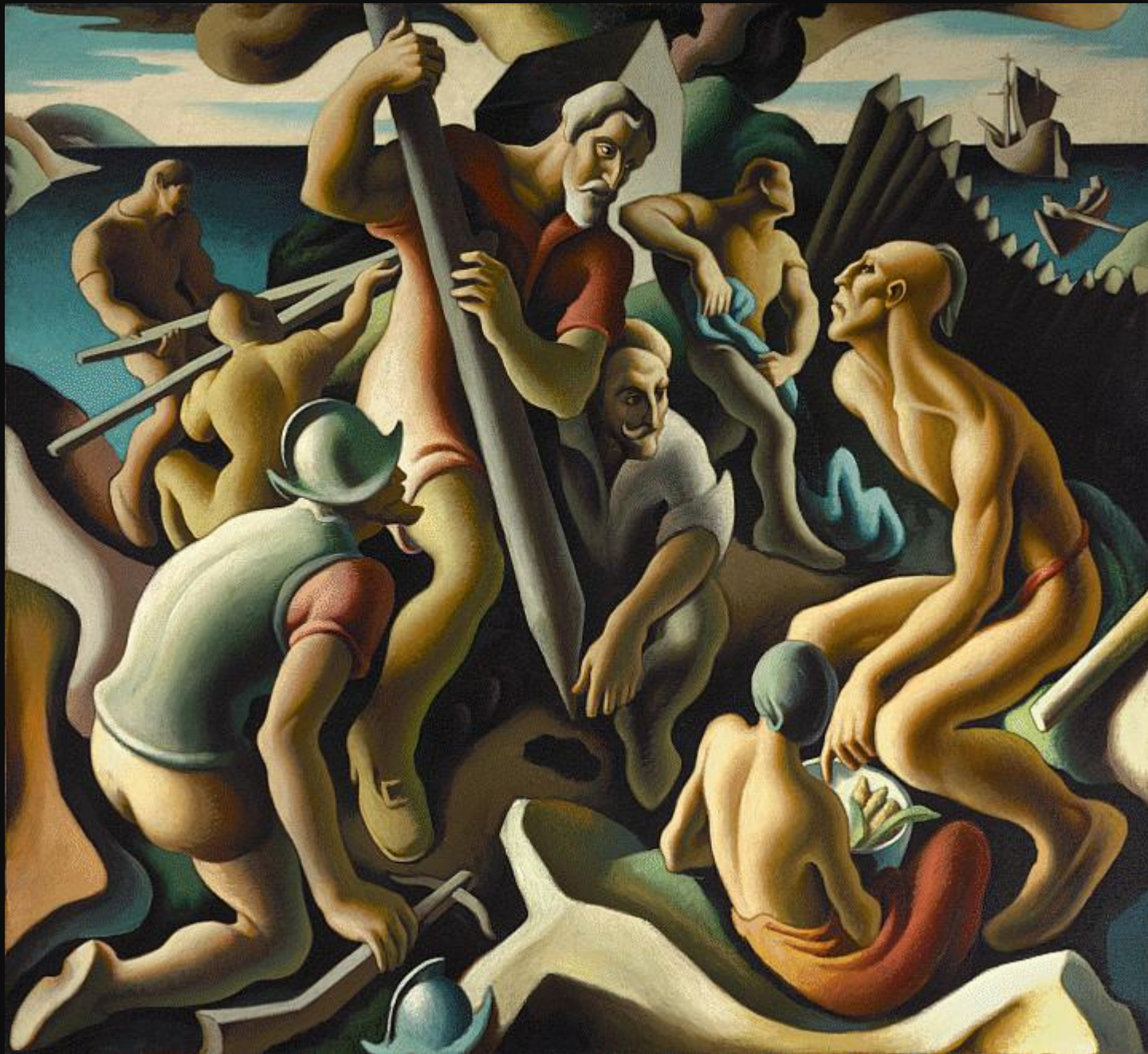
Palisades , 1921-1922, Oil on Canvas, mounted on Aluminum Honeycomb Panel, 167.96 x 182.88 cm, Nelson- Atkins Museum of Art, CA, USA https://art.nelson-atkins.org/objects/5519/the-palisades