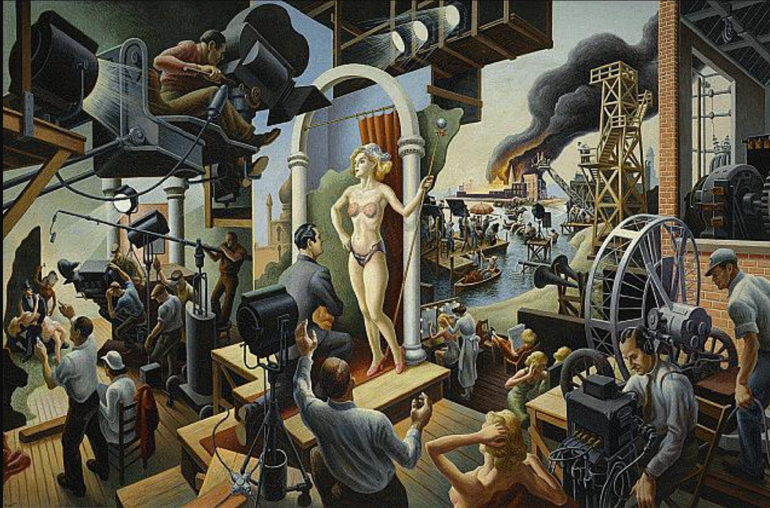
Hollywood , 1937-1938, Tempera with Oil on Canvas, mounted on Panel, 142.24 x 213.36 cm, https://art.nelson-atkins.org/objects/3029/hollywood