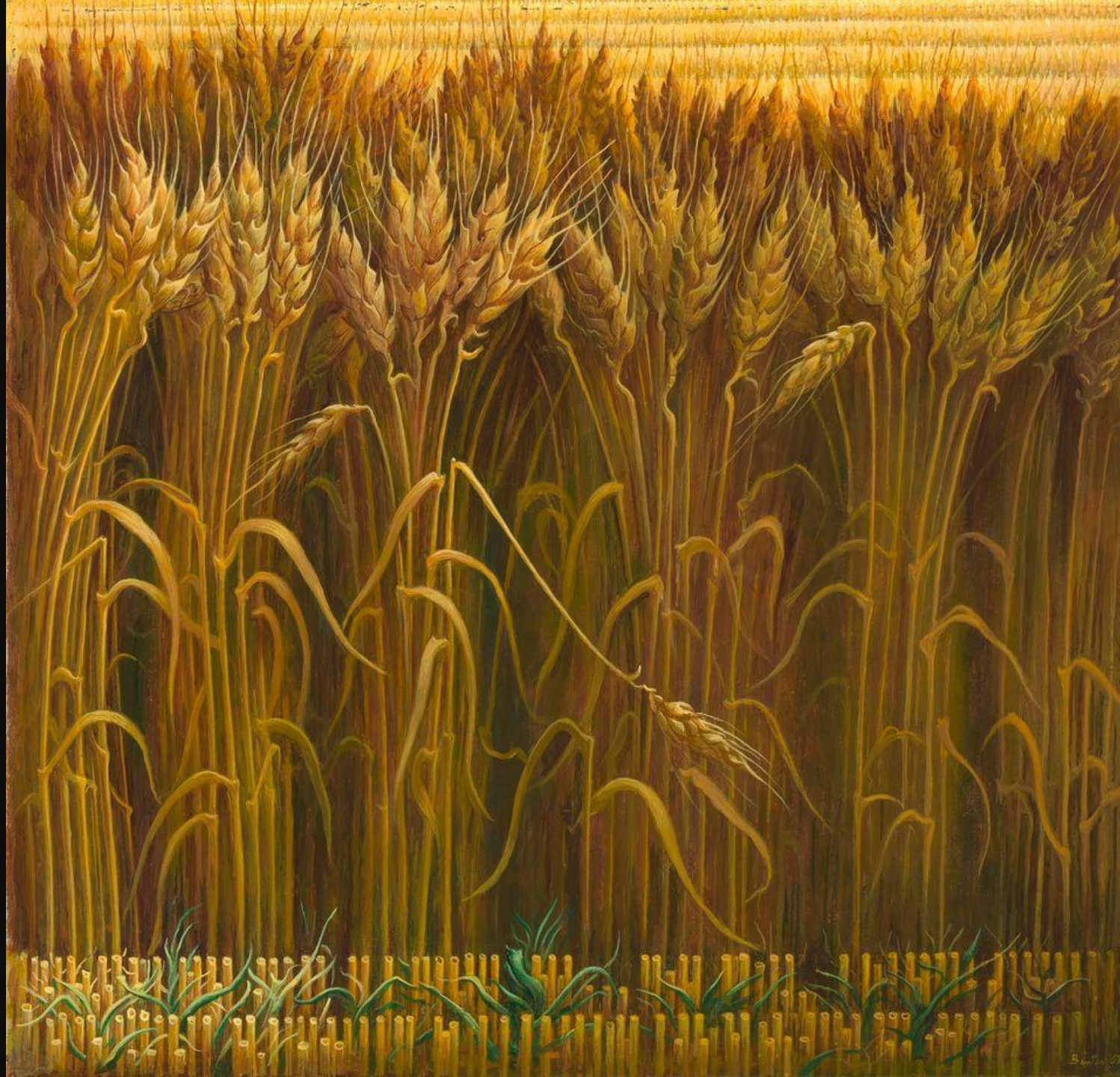
Wheat , 1967, Oil on Wood, 50.8 x 53.3 cm, Smithsonian American Art Museum, Washington DC, USA

https://americanart.si.edu/artwork/wheat-32285