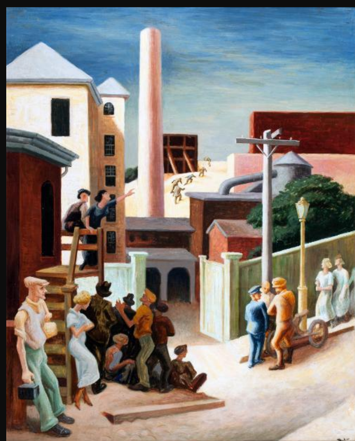
Strike, Fall River, c. 1935, Oil on Masonite, 81.3 x 66 cm, New Britain Museum of American Art, USA

https://ink.nbmaa.org/collections/17/social-realismregionalism--thomas-hart-benton/objects