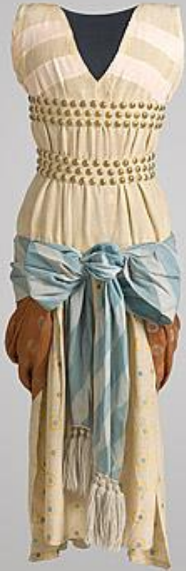
Cleopatra, Costume for a Syrian woman, 1909, cotton, silk, metal studs, paint, length 110.0 cm, National Gallery of Australia, Canberra