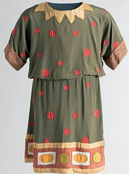
Cleopatra, Costume for a Greek, 1909, silk, lamé, metallic braid, centre back length 96.0 cm, National Gallery of Australia, Canberra