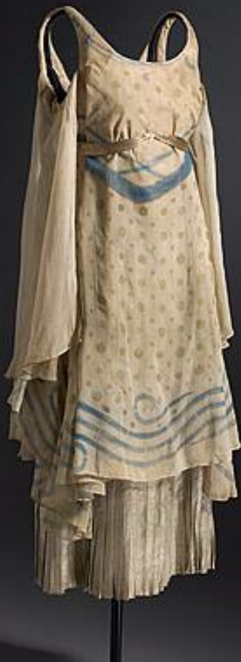
Costumes for the nymphs in the Ballet L'Après Midi d'un Faune, c.1912, in the National Gallery of Australia, Canberra