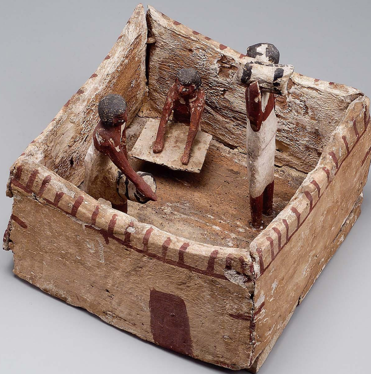
Model of a Granary, Middle Kingdom, late 11th Dynasty- early 12th Dynasty, 1220-10- 1961 BC, Egypt, Deir el-Bersha, Tomb 10, shaft A (Djehutynak ht), Wood, 29 x 28.5 x 27 cm, MFA, Boston, MA, USA

https://collections .mfa.org/objects/ 143702/model-of- a- granary?ctx=705d 4cbd-7aa2-4888- 8a76- 805602be74d7&i dx=32