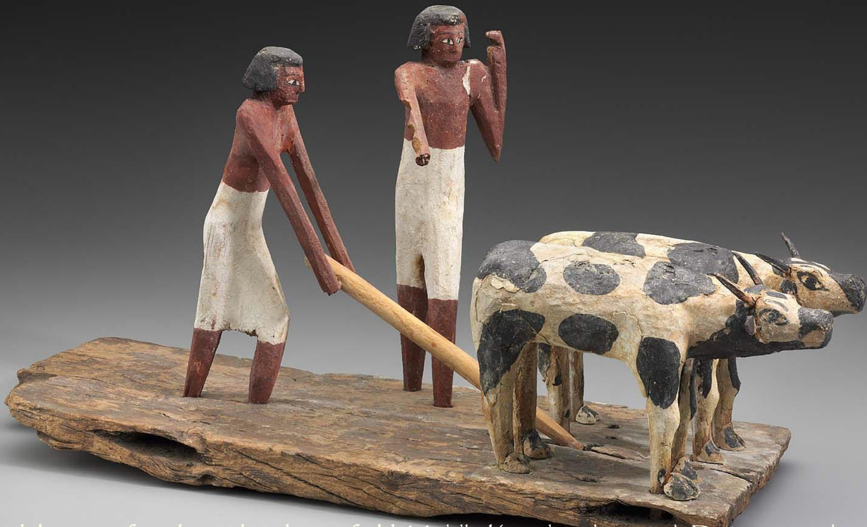
Model scene of workers ploughing a field, Middle Kingdom, late 11th Dynasty-early 12th Dynasty, 1220-10-1961 BC, Egypt, Deir el-Bersha, Tomb 10, shaft A (Djehutynakht), Wood, Length: 54 cm, MFA, Boston, MA, USA https://smarthistory.org/egyptian-social-organization-from-pharaoh-to-farmer/