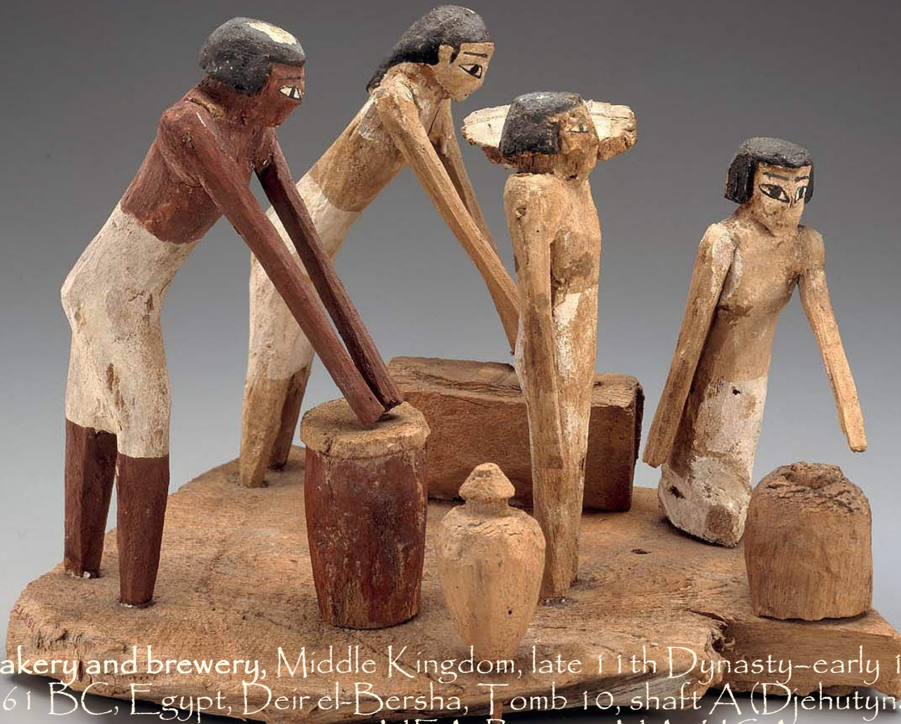
Model of a bakery and brewery, Middle Kingdom, late 11th Dynasty–early 12th Dynasty, 1220–1010–1961 BC, Egypt, Deir el-Bersha, Tomb 10, shaft A (Djehutynakht), Wood, 22 x 24.3 x 28 cm, MFA, Boston, MA, USA https://collections.mfa.org/objects/143960/model-of-a-bakery-and-brewery?jsessionid=90EA23276439B76C4105F078202F77D6