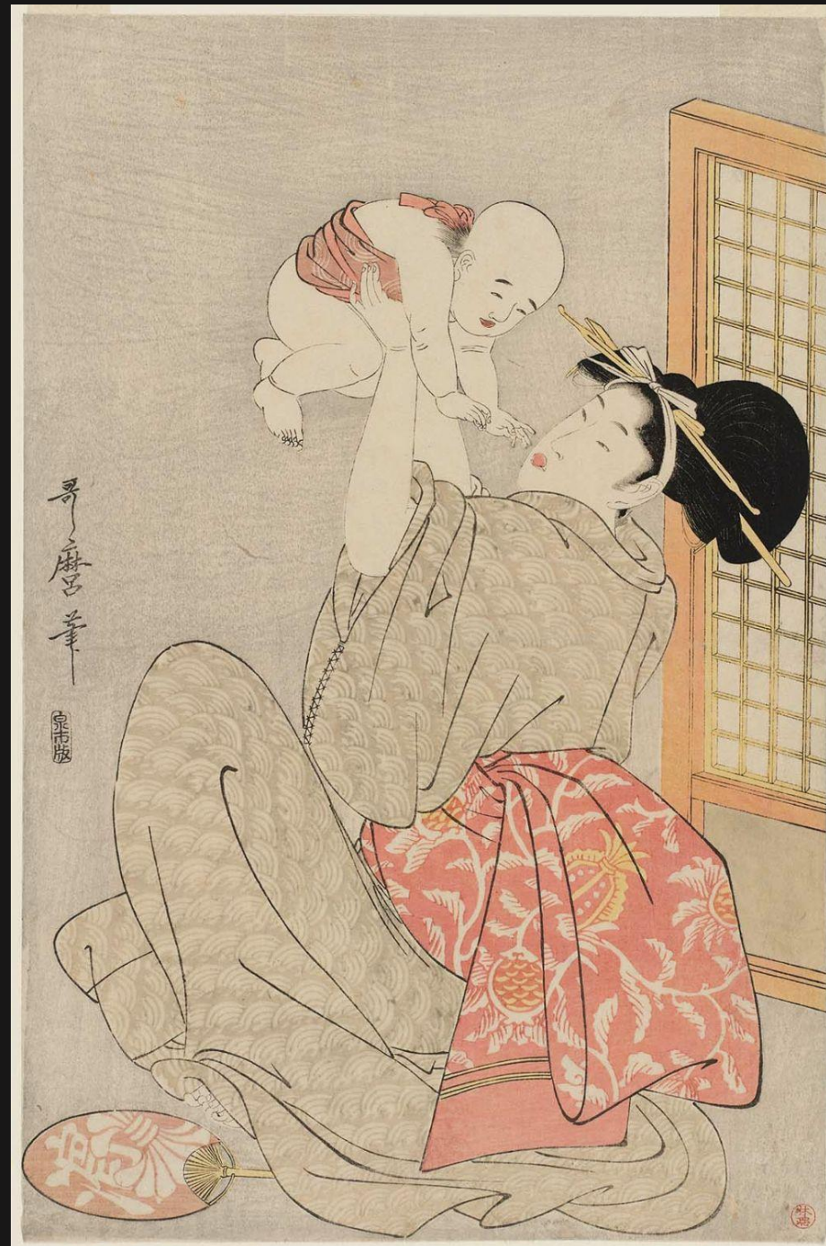
Kitagawa Utamaro, 1753 (?)–1806 Mother bouncing her baby, 1808, Woodblock print (nishiki-e); ink and color on paper, 36.8 x 24.8 cm, MFA, Boston, USA