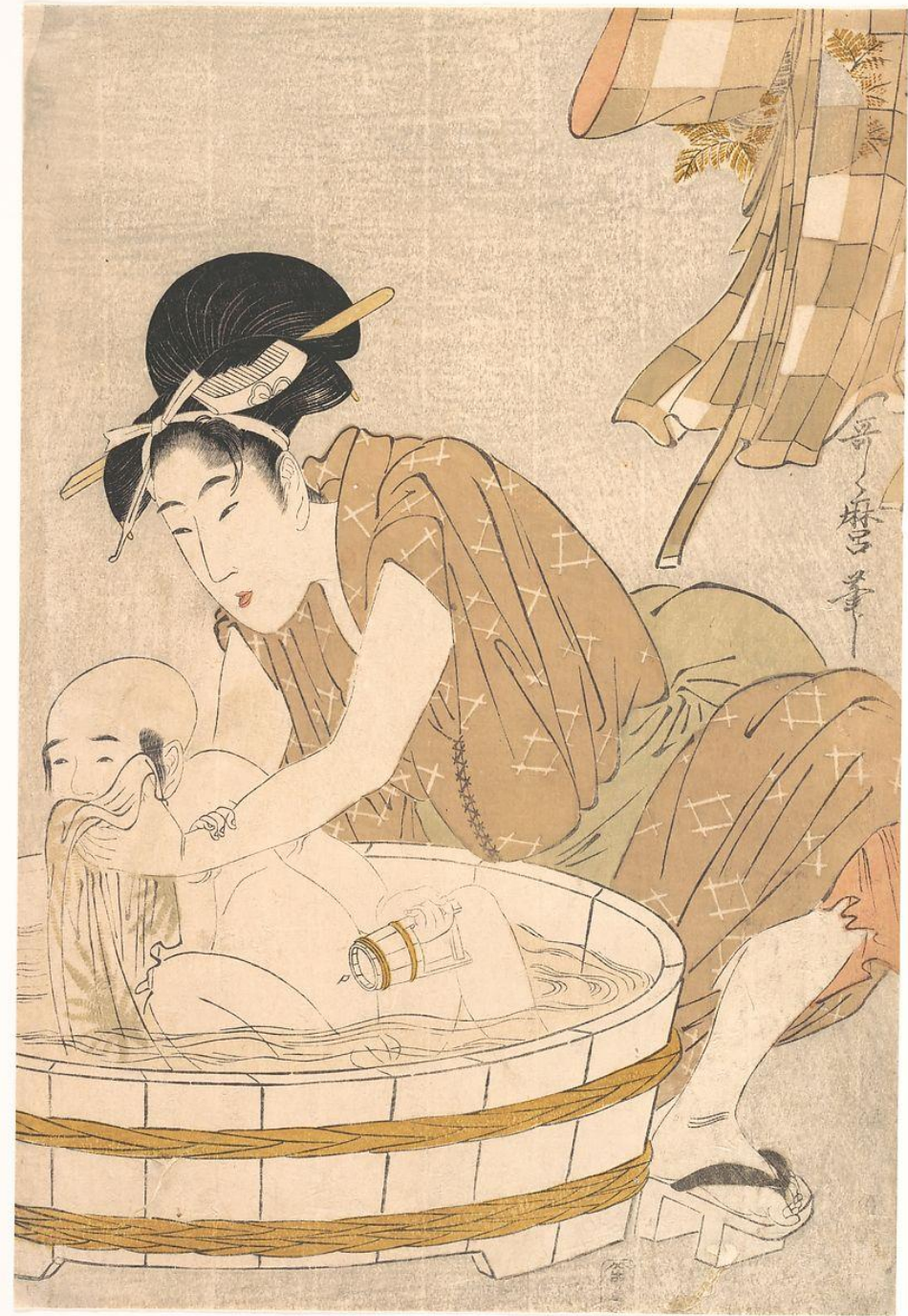
Kitagawa Utamaro, 1753 (?)–1806 Bathtime , 1801, Woodblock print; ink and color on paper, 37.3 x 25.1 cm, the MET, NY, USA