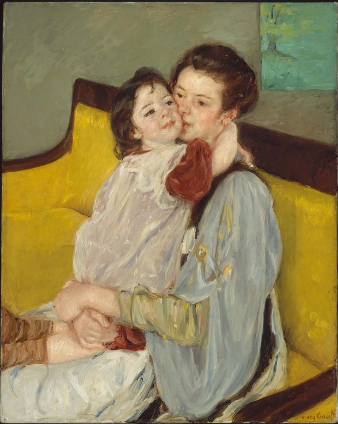
Mary Stevenson Cassatt, 1844–1926 Cares Maternelle , c. 1902, Oil on canvas, 92 x 73 cm, Museum of Fine Arts, Boston, USA