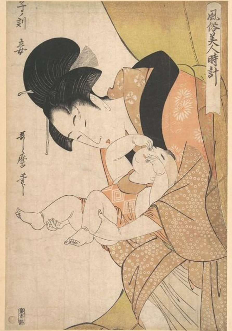
Kitagawa Utamaro, 1753–1806 Midnight: The Hours of the Rat; Mother and Sleepy Child , Edo period (1615–1868), ca. 1790, Polychrome woodblock print, The MET, NY, USA