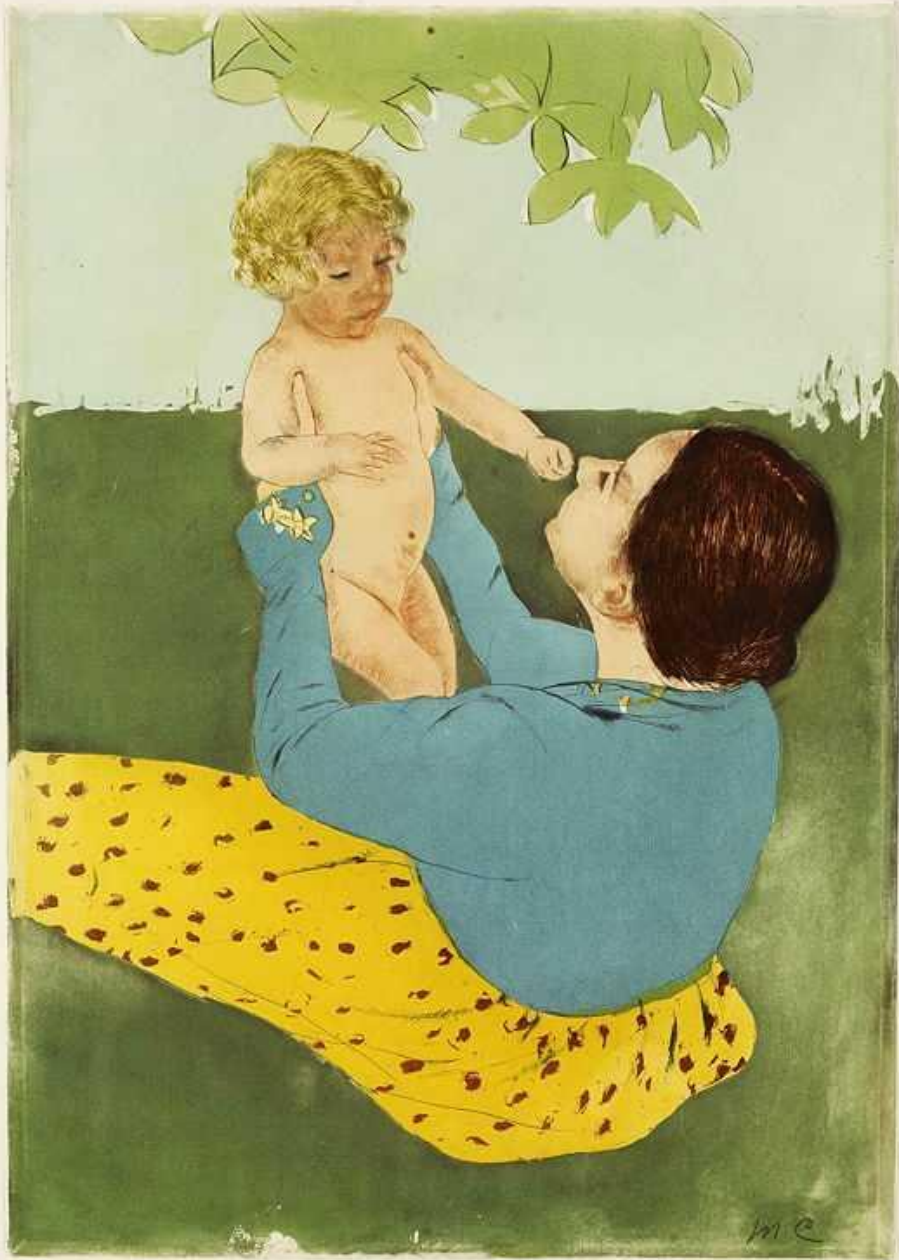
Mary Stevenson Cassatt, 1844–1926 Under the Horse Chestnut Tree, 1898, drypoint and aquatint print, 40.5 x 28.4 cm, Museum of Fine Arts, Houston