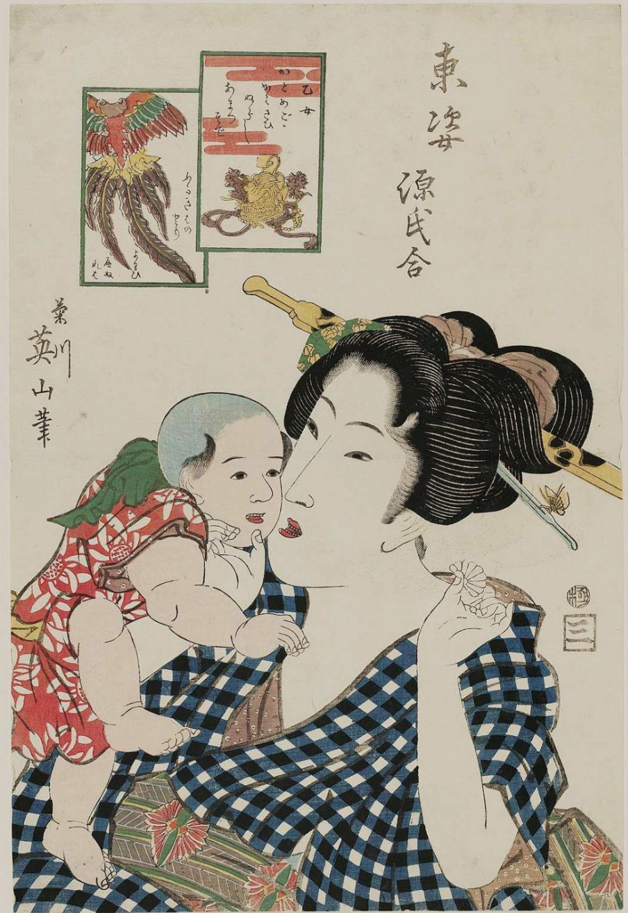
Kikukawa Eizan 1787–1867 Otome , from the series Eastern Figures Matched with the Tale of Genji , 1818–1823, Woodblock print; ink and color on paper, 37.4 x 25.1 cm, MFA, Boston, USA