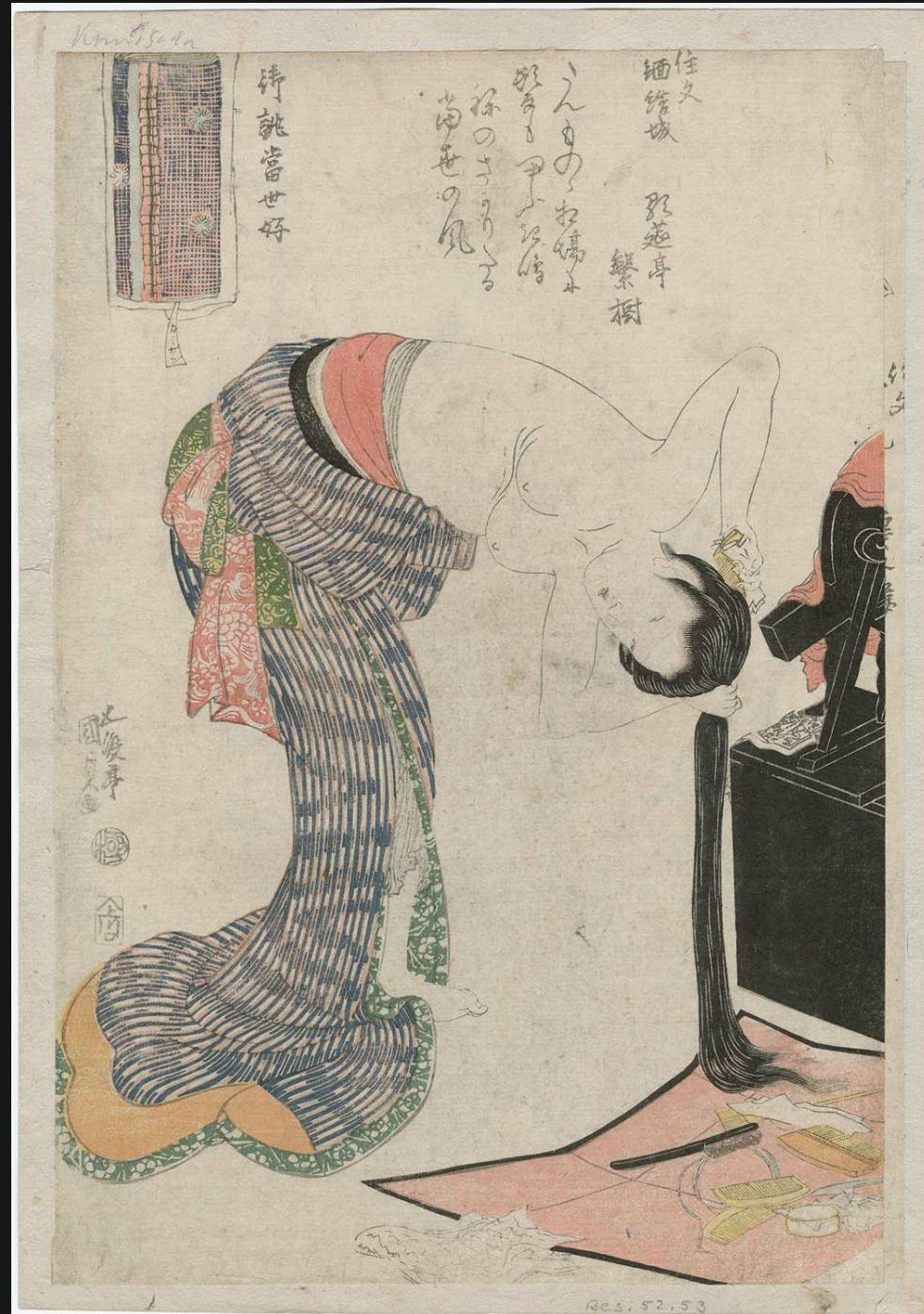
Kitagawa Utamaro, 1753 (?)–1806 An Order of Noodle Stripes, from the series Current Fabrics to Your Order, 1818, Woodblock Print, ink and colour on paper, 36.6 x 24.6 cm, MFA, Boston, USA